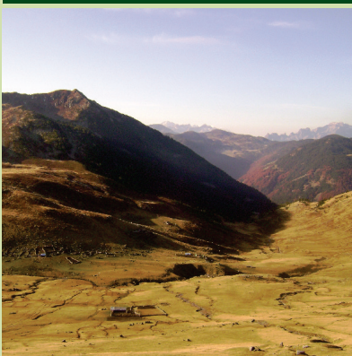
Peaks of the Balkans supported by: